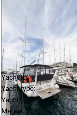
Yacht ID: Yacht type: Yacht Marina: